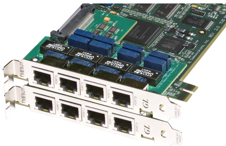
Octal PCIe Card