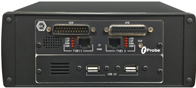
Figure: mTOP™ Probe T1 E1 tProbe™ (Front Panel)