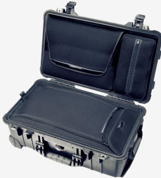
Pelican Carry Case

Pelican Carry Case to carry the portable devices and accessories.