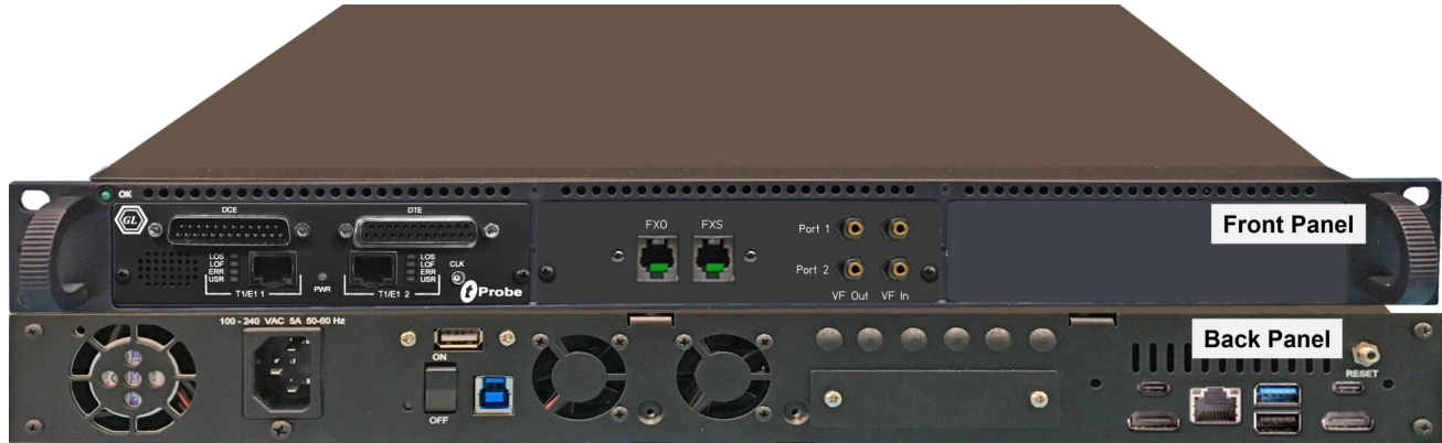
Figure: mTOP™ T1 E1 tProbe™ 1U Rack Unit