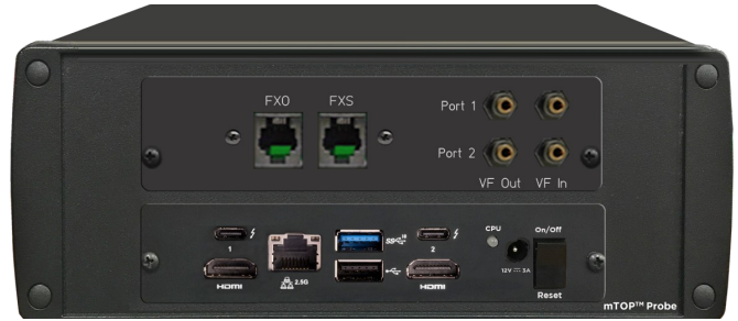
Figure: mTOP™ Probe T1 E1 tProbe™ (Back Panel)