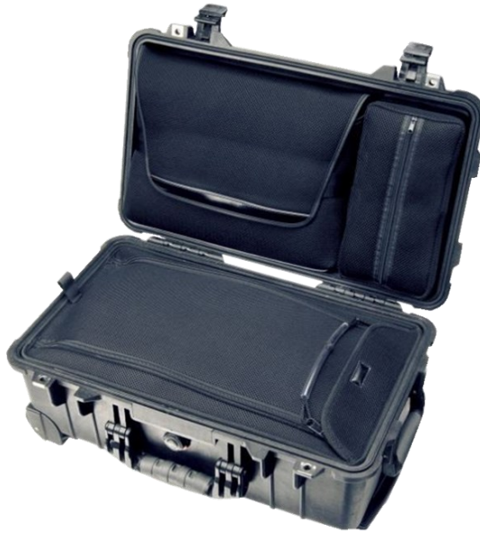
Pelican Carry Case

Pelican Carry Case to carry the portable devices and accessories.